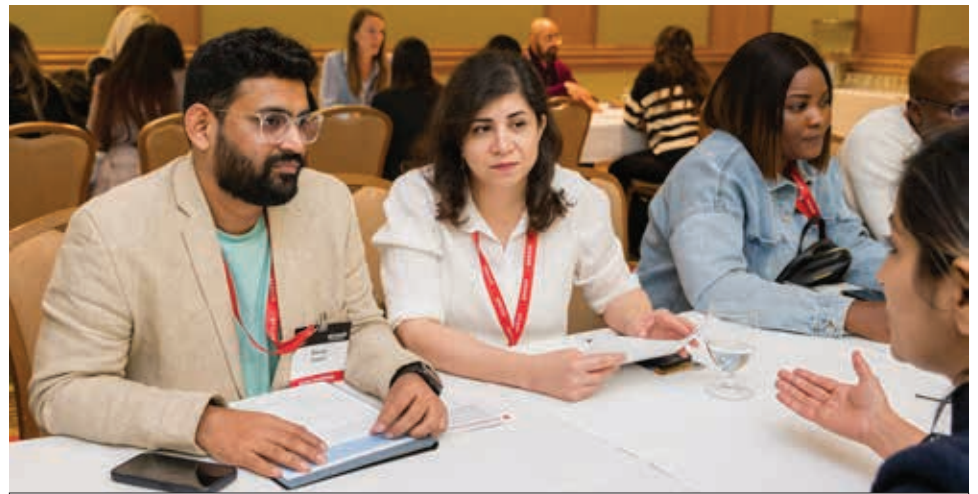
Jobseekers and employers network at ACCES Employment's Speed Mentoring Marathon®